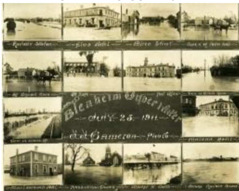
From the Gamble and Stace collections

You can view the exhibits at any time by visiting www.marlboroughmuseum.org.nz and choosing "View Collections"