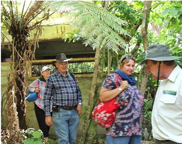
The group moves inland