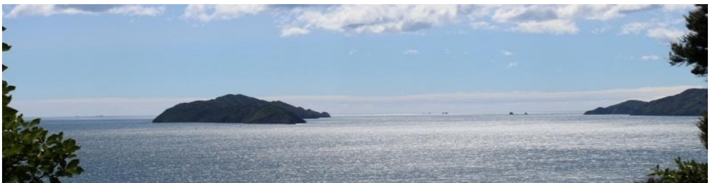
Gunlayer's view. No Japanese warships in sight today!