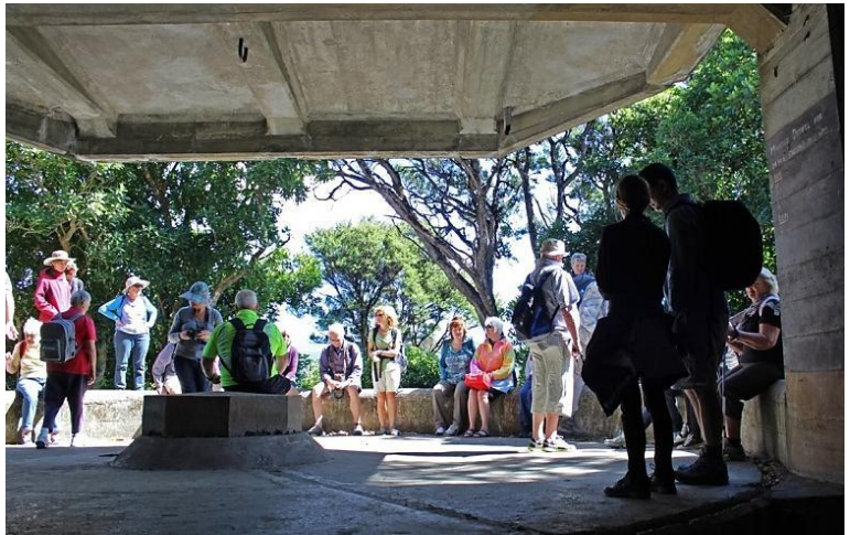
In the shelter of the gun emplacement