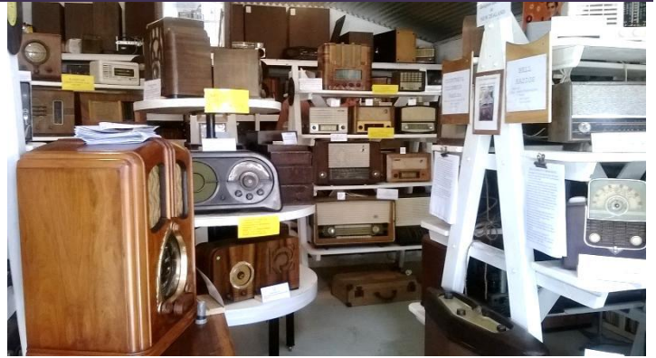
Our Radio shop custodians and Marlborough Amateur Radio "Hams" presented the sounds of the past on Heritage Day