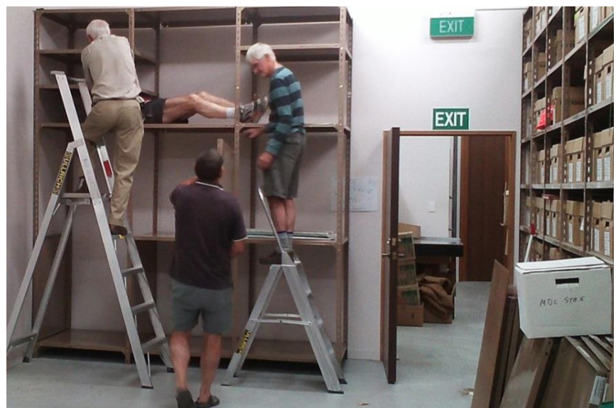
More maintenance - Volunteers install new archives shelving