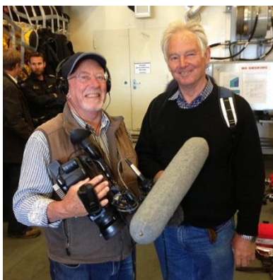
Film Crew on board HMNZS Otago

Many members of our Society took the opportunity to tour the Edwin Fox, noting especially the extensive development of replica bunks and living quarters such as endured by our early immigrants. Some even took the somewhat extreme step of spending a night on board, much like their forebears did! No doubt the traditional Royal Navy rum issue helped to pass the night.