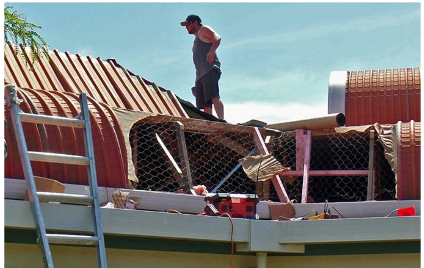
Roof repairs – part of the on-going maintenance programme