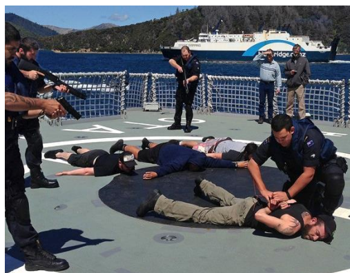
Tory Channel Pirates captured