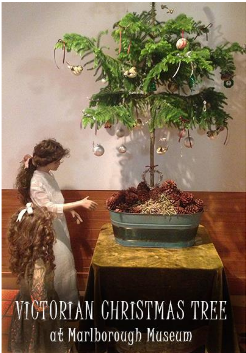
VICTORIAN CHRISTMAS TREE at Marlborough Museum

Dr Monro became the Member of Parliament for Waimea in 1854 and went on to serve as a highly-regarded Speaker of the House through six changes of Government. Bankhouse Station near Renwick was his Marlborough home. Sir David Monro died in 1877.