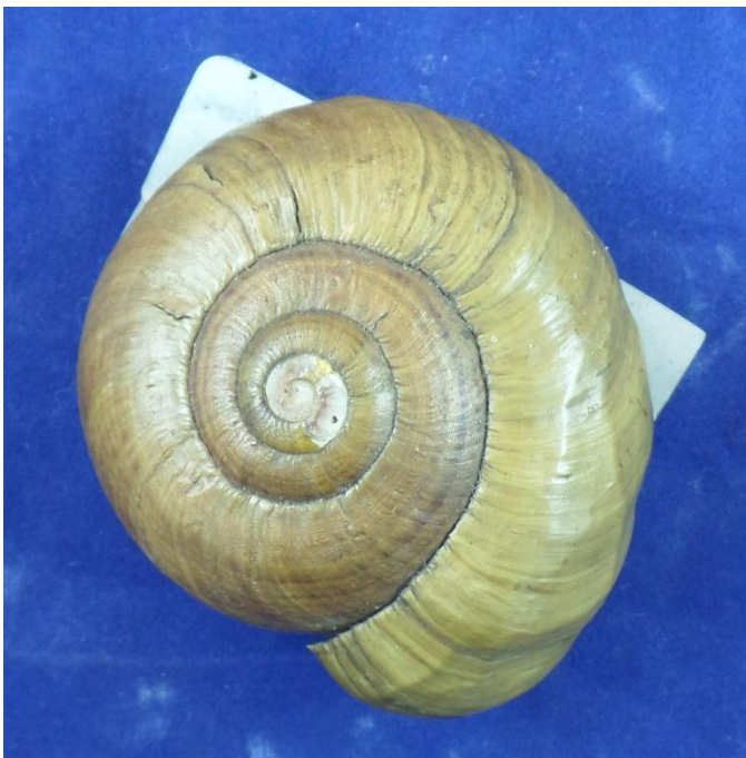
Native Snail Shell from Mt Robertson in "Wild Things"