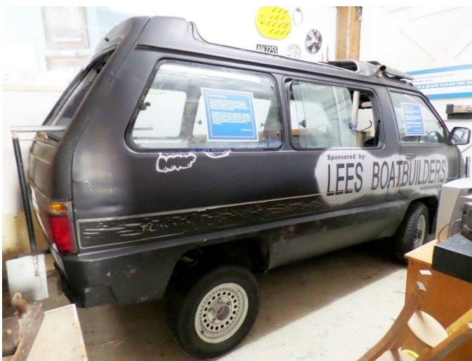
Roofless - the first amphibious vehicle to complete the 65 kilometre journey across Cook Strait from "Roofless", an Edwin Fox Society exhibit.