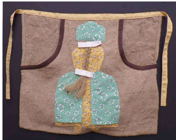
"Dutch Girl" laundry apron intended to hold pegs, from "Kiwiana".