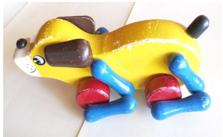
Wooden Toy Dog from "Kiwiana"