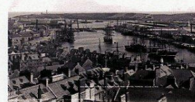
Aberdeen Harbour

Contains extensive illustrations, indexing, bibliography and endnotes.