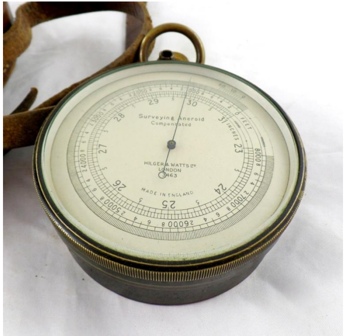
Hilger and Watts compensated aneroid barometer from "Mapping Marlborough"

To access the site go to www.marlboroughmuseum.org.nz and click the Collections Online link. From there click Recently Added to select from the new material. Here are some samples to enjoy.