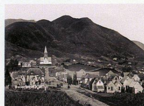
Nelson c1863: Nelson Prov. Museum